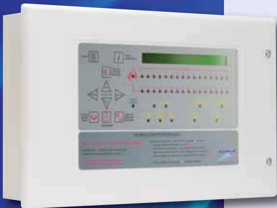
XFP 1 or 2 Loop 32 Zone Panel