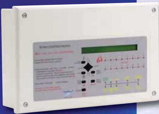
XFP Single Loop 16 Zone Panel

Fully approved to EN54 parts 2 & 4 by the Loss Prevention Certification Board, the XFP Range of networkable analogue addressable fire alarm control panels offers high performance at a competitive price. Available in two different versions (a cost-effective single loop 16 zone panel supplied in a plastic enclosure and a robust 1 or 2 loop 32 zone metal panel), the range offers an array of user and installer-friendly features.